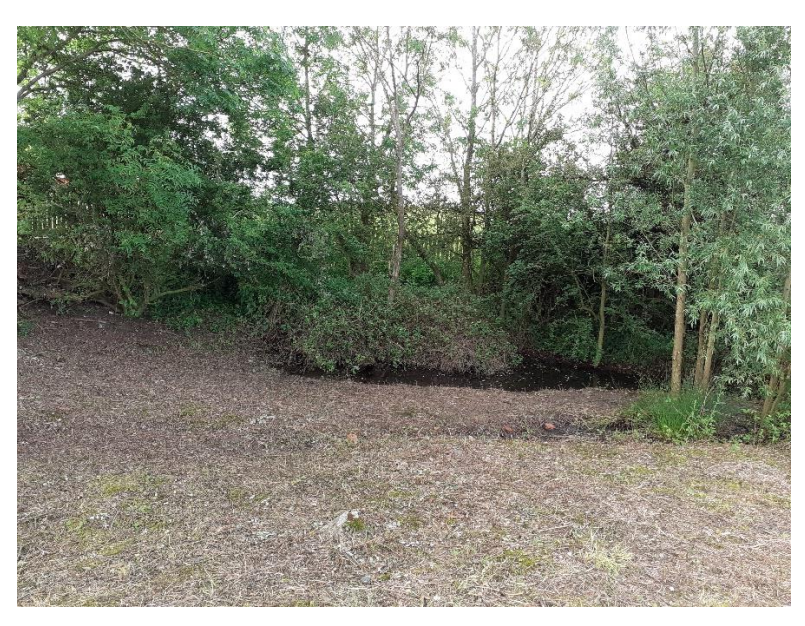
We also participated in the Less Litter for Leicester campaign. Every class went on a litter pick and we collected 25.5kg of litter!